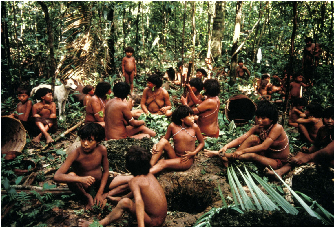
Figure 2: The Yanomami are the largest relatively isolated tribe in South America. They live in the rainforests and mountains of northern Brazil and southern Venezuela.

established neurologically 28 . As a result, he developed prosocial behaviour. In linguistics, it is argued by language scientists that this pro sociality was also crucial for language acquisition 29 . The obvious assumption is that this supported egalitarian relations for tens of thousands of years.